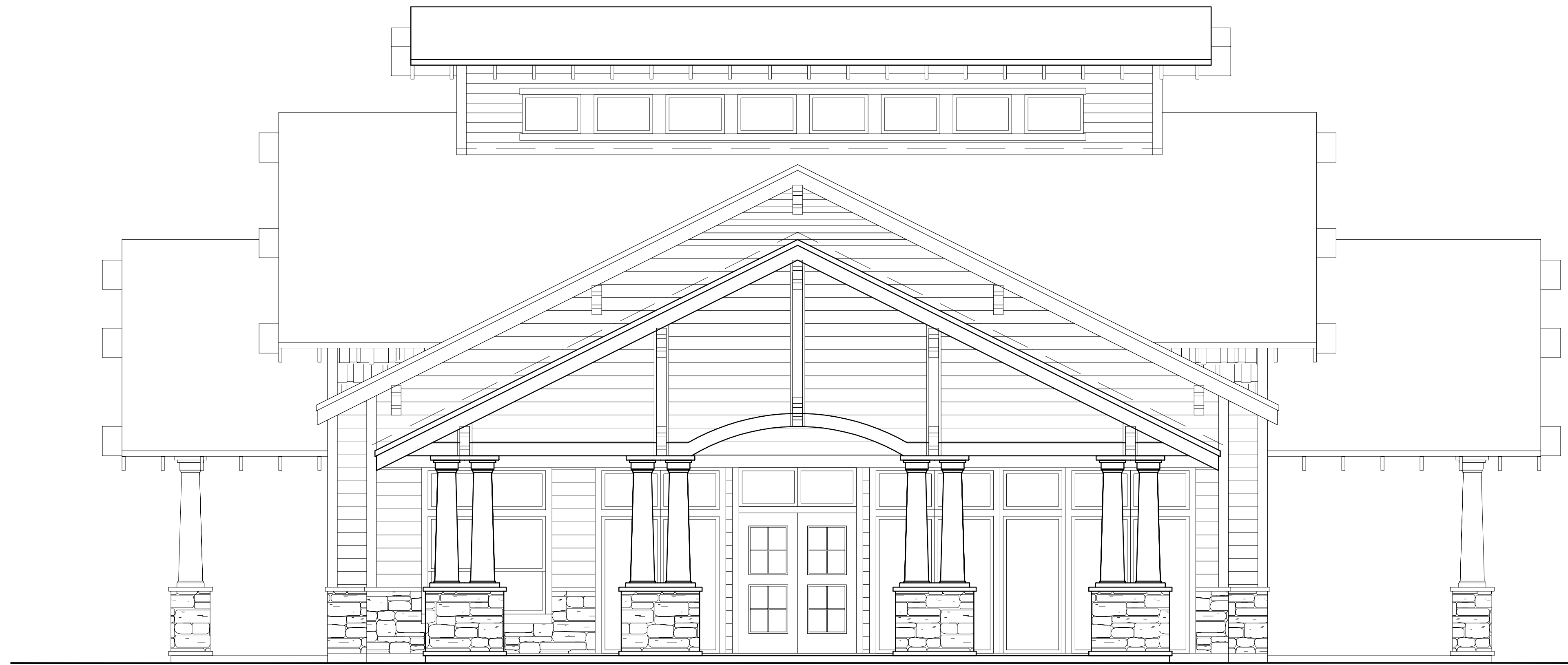
01 CLUBHOUSE RIGHT ELEVATION SCALE: 1/4"=1'-0"