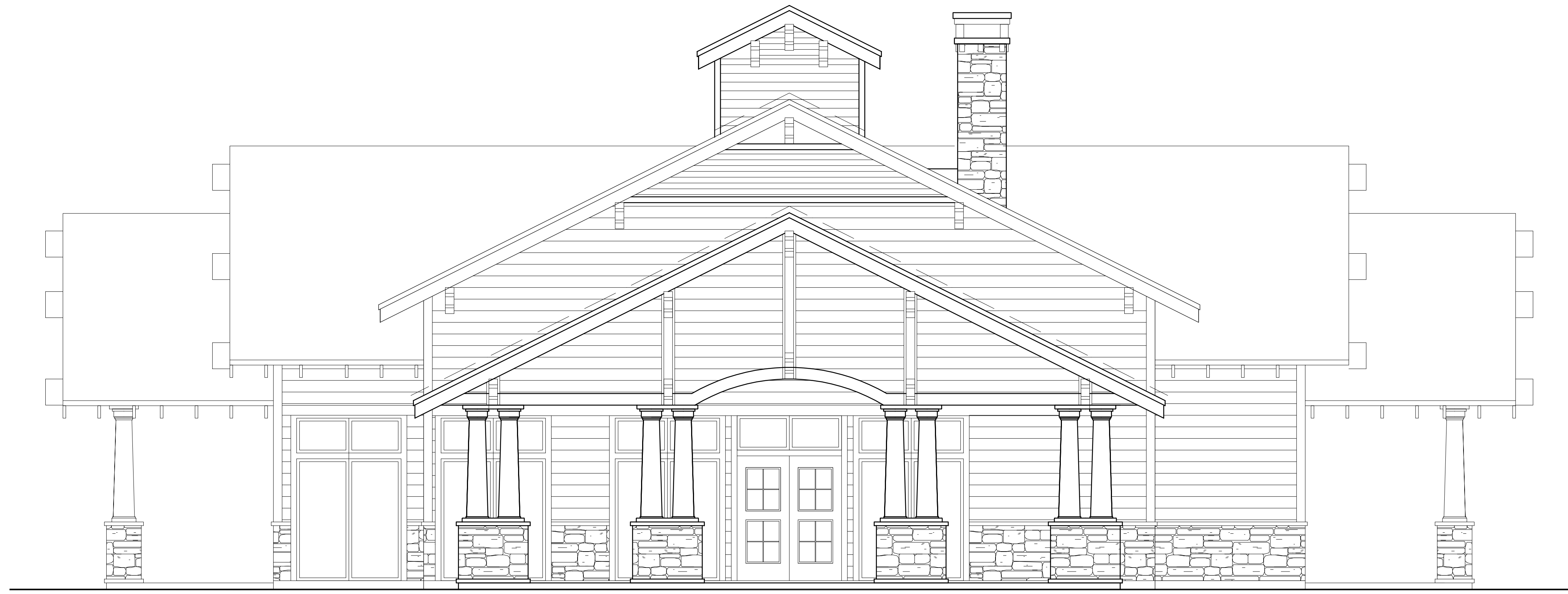
02 CLUBHOUSE REAR ELEVATION SCALE: 1/4"=1'-0"