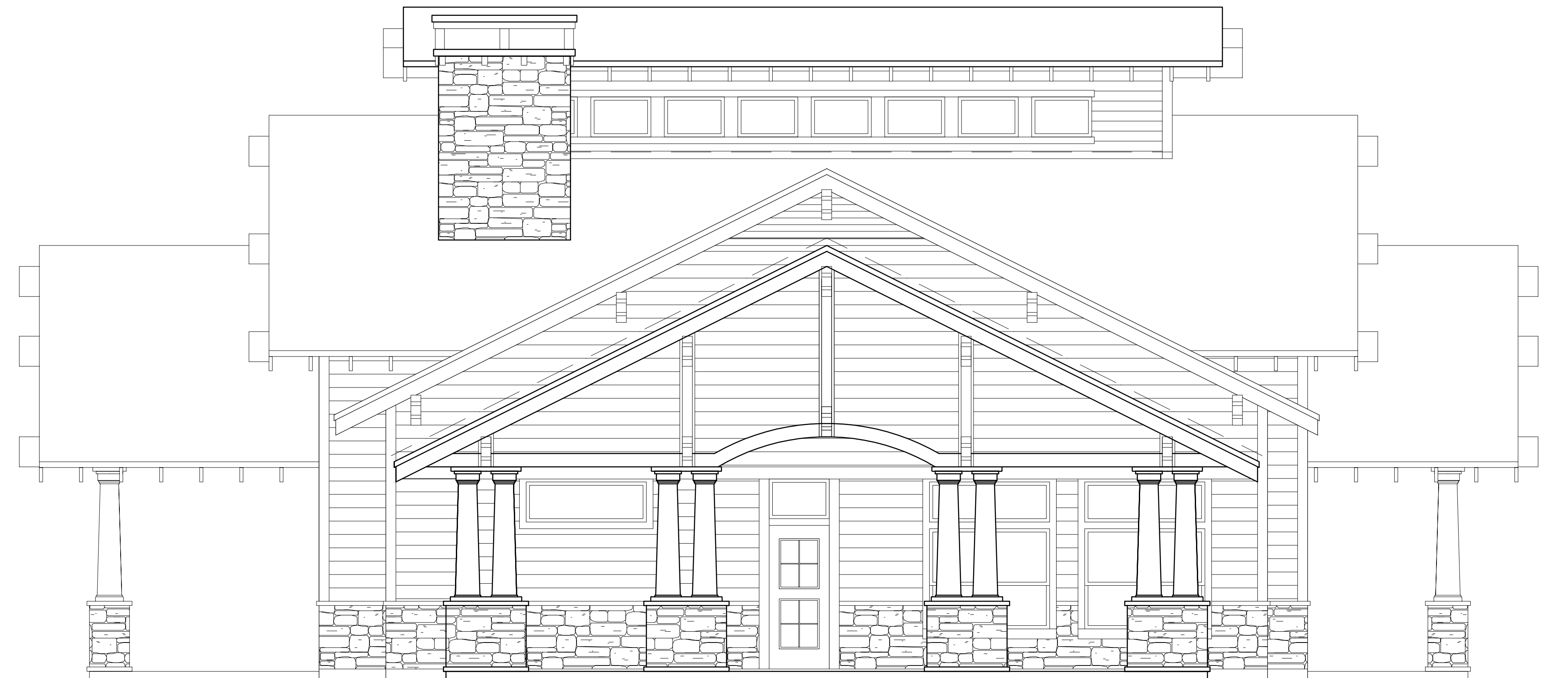
02 CLUBHOUSE LEFT ELEVATION SCALE: 1/4"=1'-0"