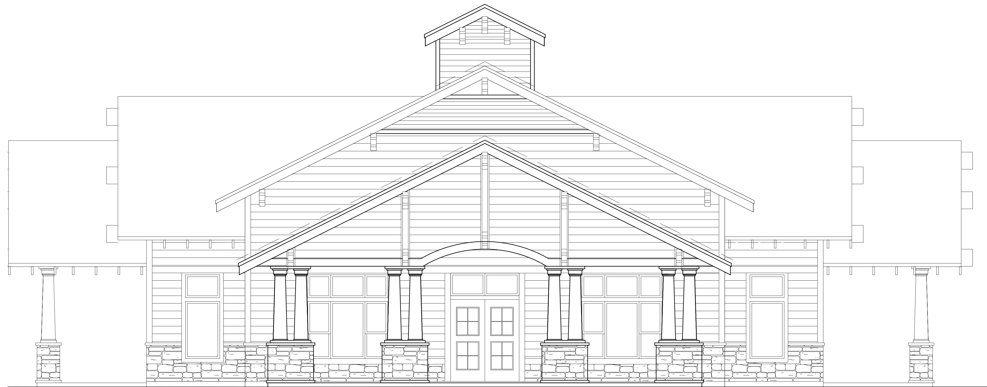
01 CLUBHOUSE FRONT ELEVATION SCALE: 1/4"=1'-0"