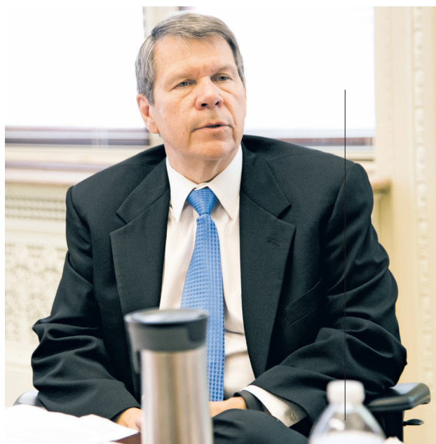
TABLE OF EXPERTS

We were the first gigabit city in the state of Illinois.... We've seen people come into Highland just because of the technology we have.