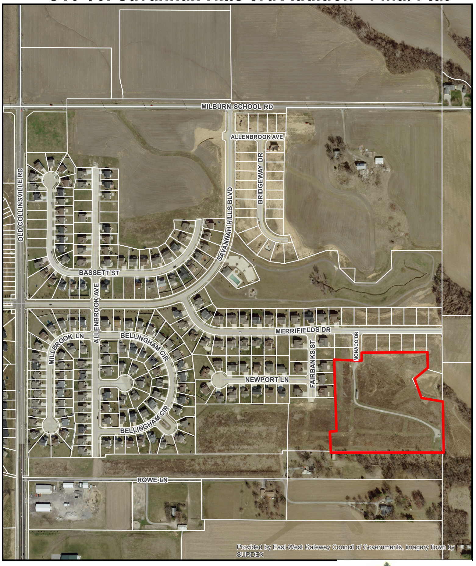
S16-06: Savannah Hills 3rd Addition - Final Plat