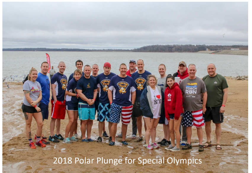
2018 Polar Plunge for Special Olympics