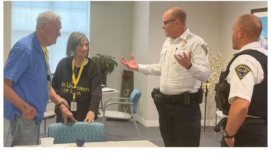
Senior Education Series Session 1 Colonnade & Revela