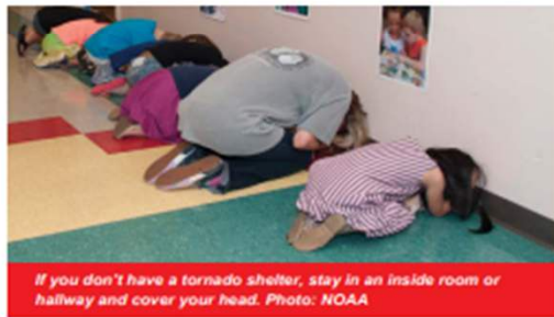
If you don't have a tornado shelter, stay in an inside room or hallway and cover your head.