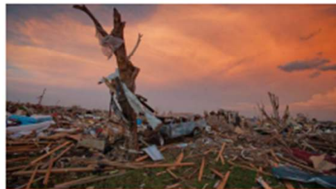
After a tornado, watch out for dangerous debris such as sharp metal, glass or downed power lines.